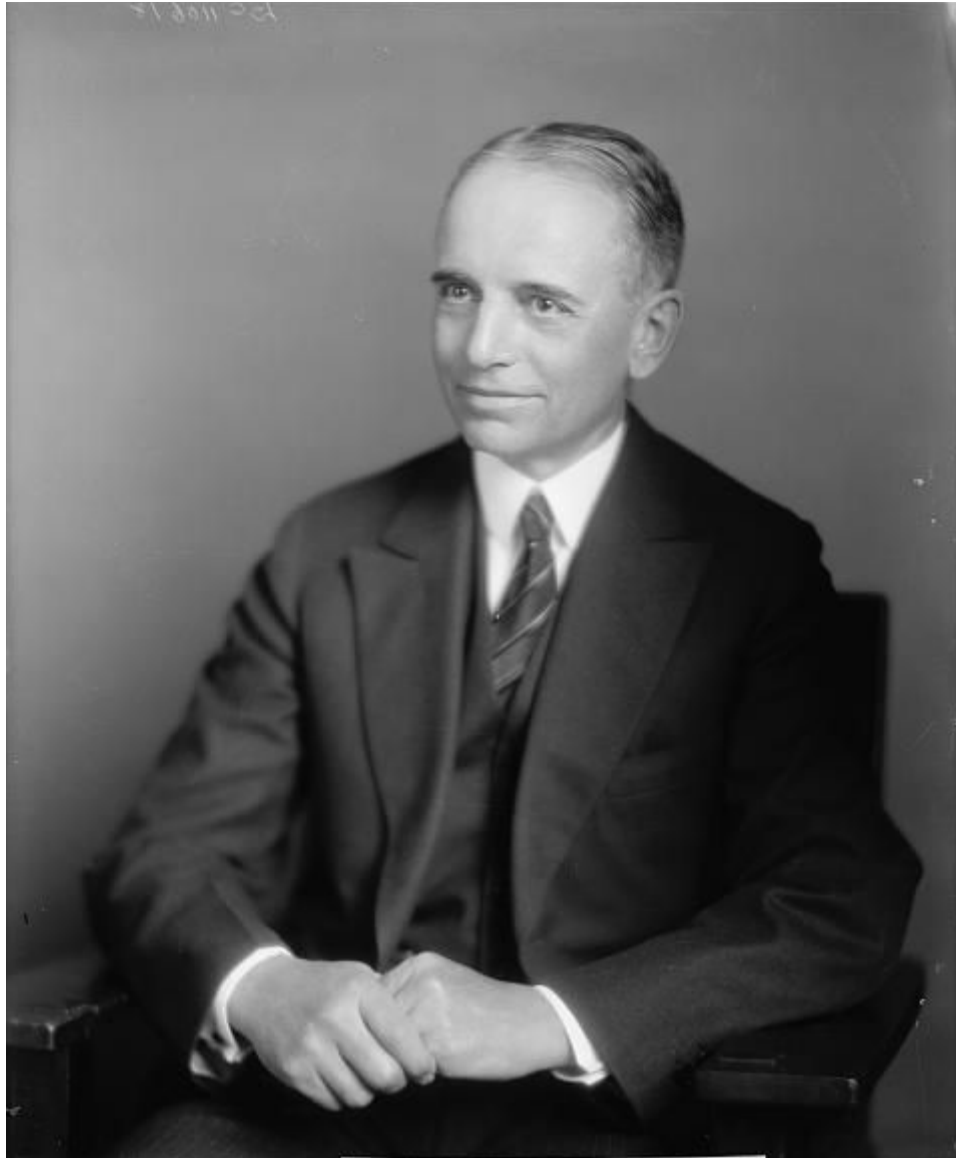
Attorney General Mitchell (ca. 1929-1933)