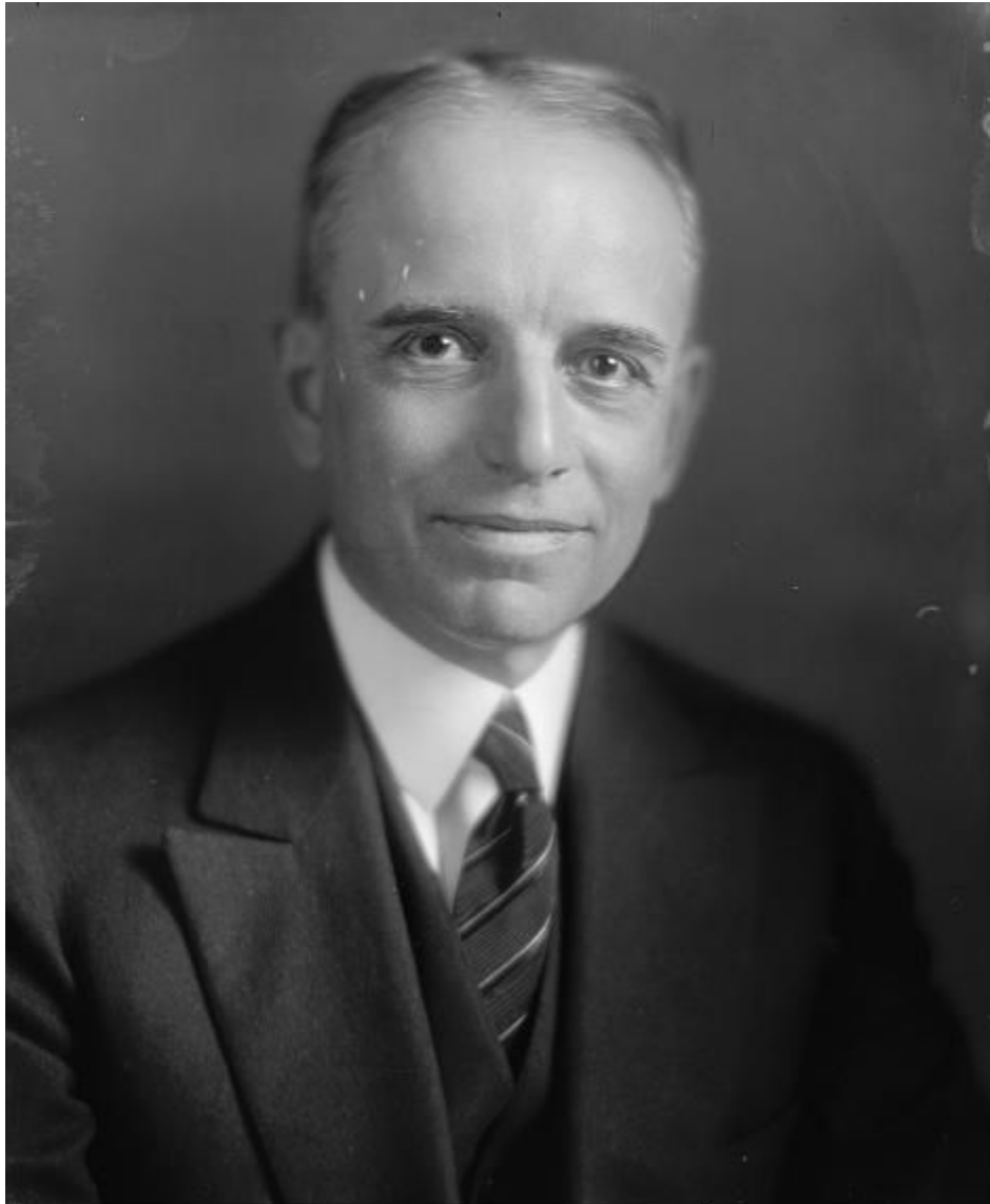
Attorney General Mitchell (ca. 1929-1933)

Harris & Ewing Collection, Library of Congress.