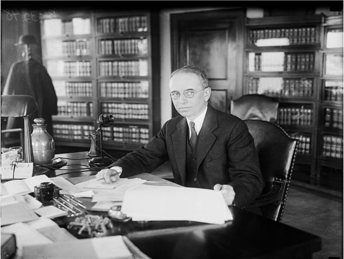
The Attorney General in his office, Washington D. C. (1929). Harris & Ewing Collection, Library of Congress.