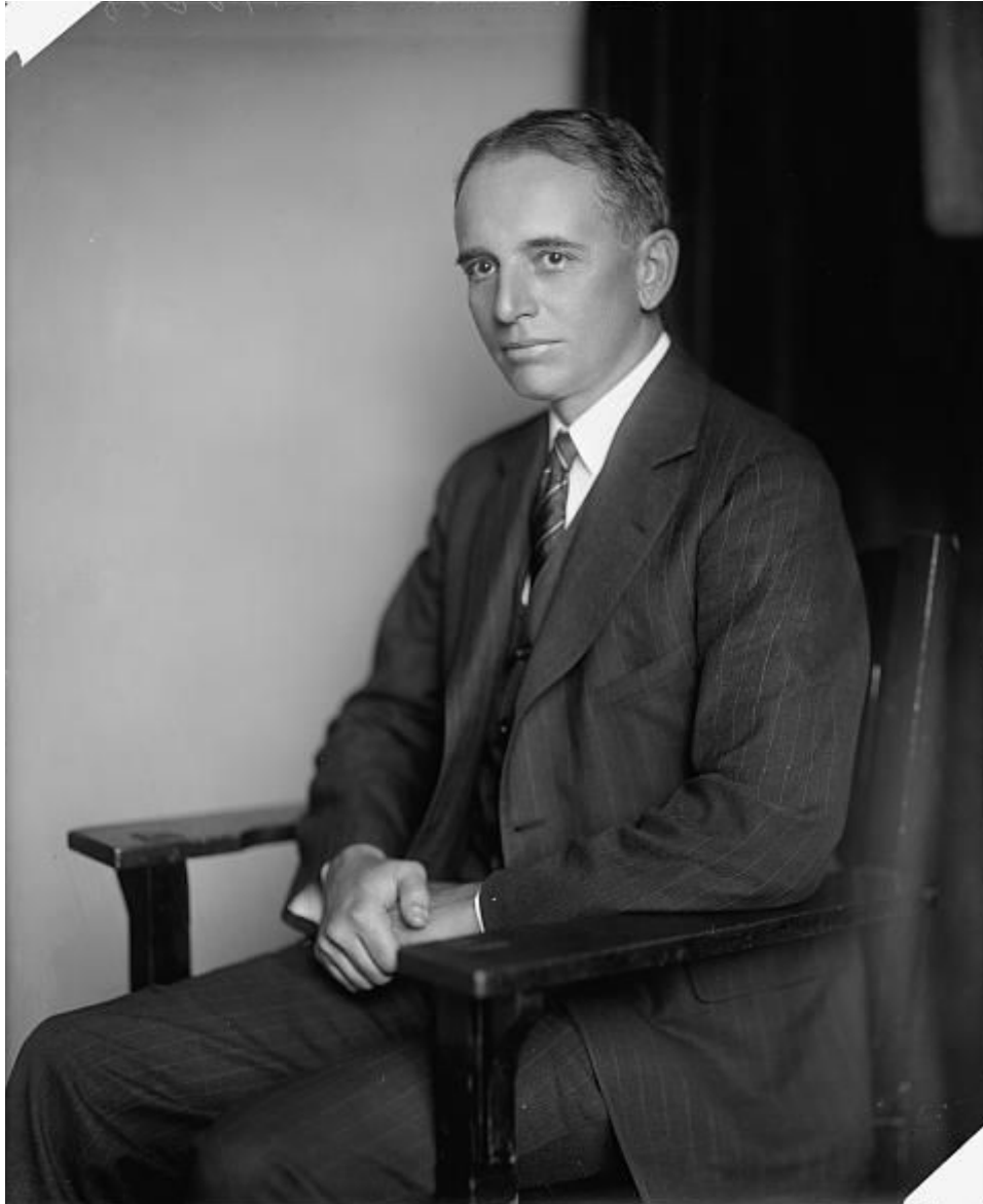
Attorney General Mitchell (ca. 1929-1933).