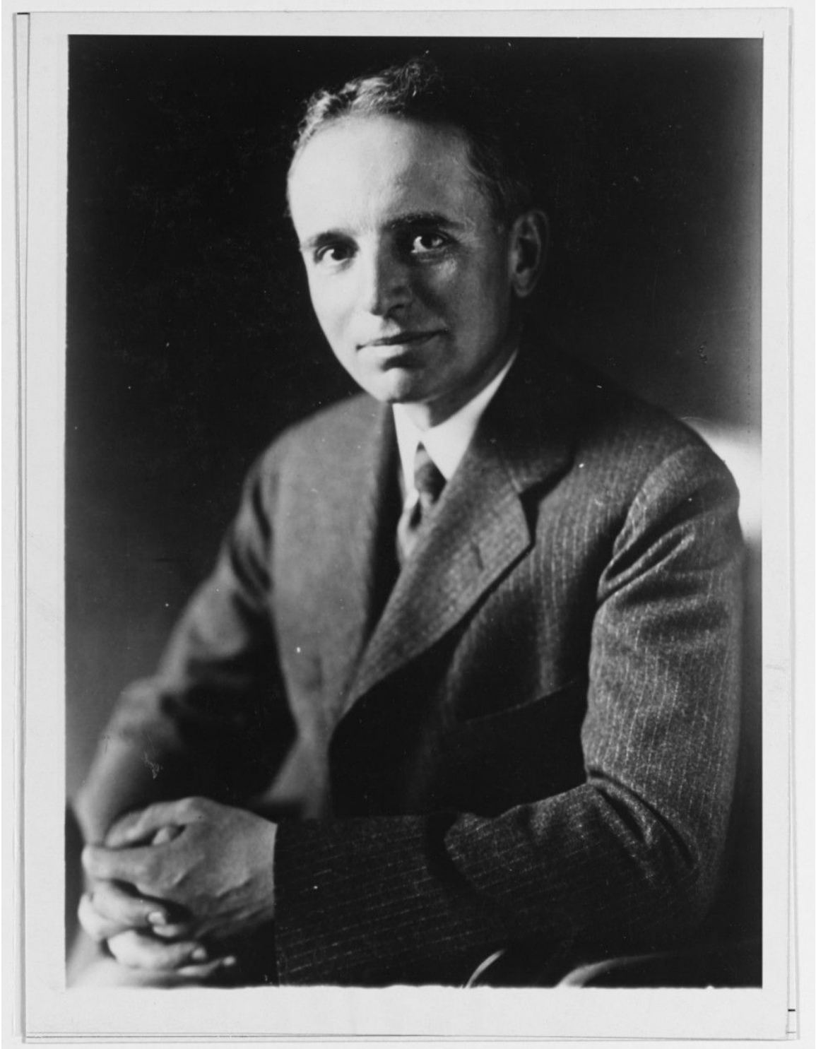
Attorney General Mitchell Date of photograph: 1929.