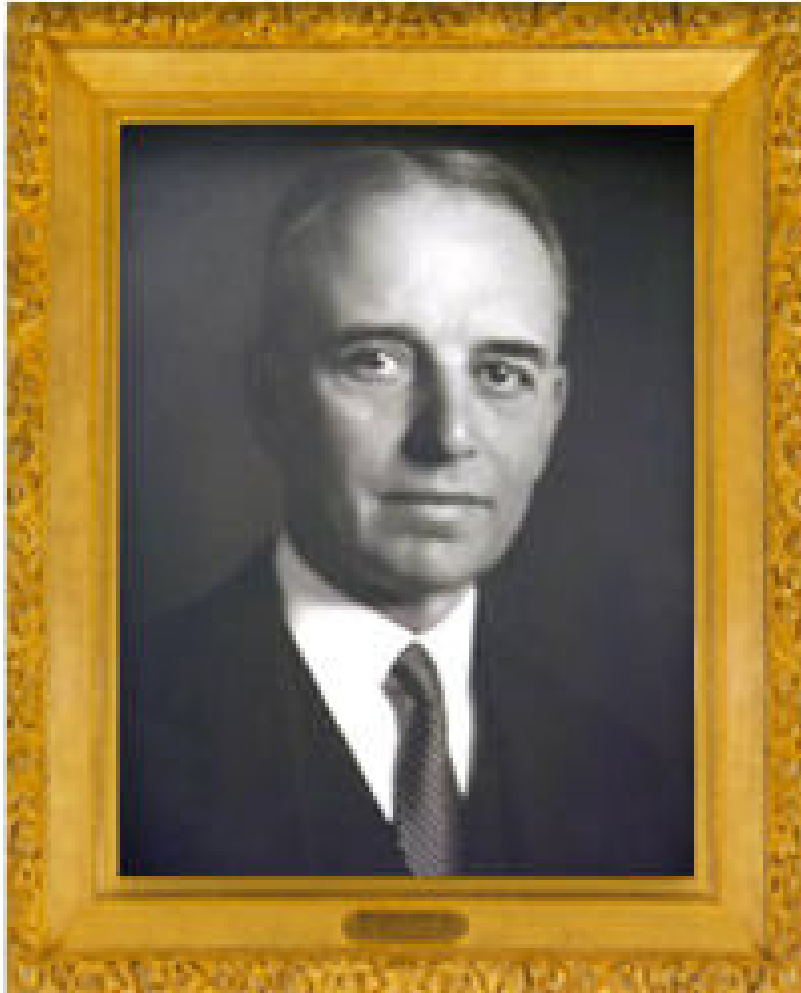
Solicitor General William D. Mitchell