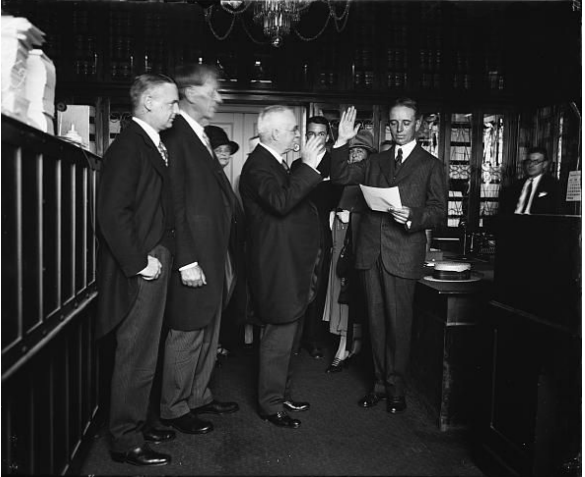
Solicitor General Mitchell taking oath of office (ca. June 4, 1925).