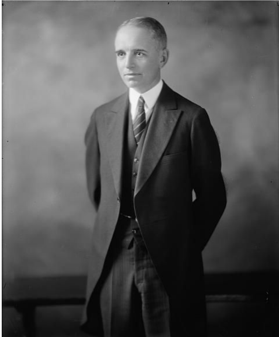
Attorney General Mitchell (ca. 1929-1933)