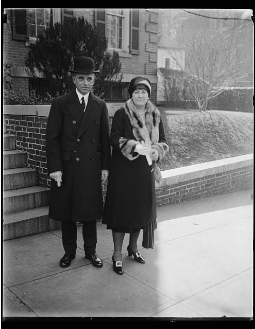
The Attorney General and his wife in Washington D. C. (1929).