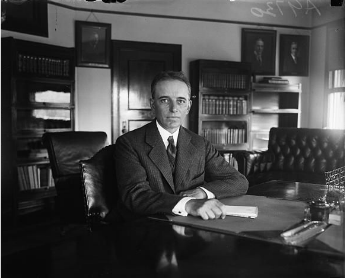
Solicitor General William D. Mitchell at his desk. (1925).